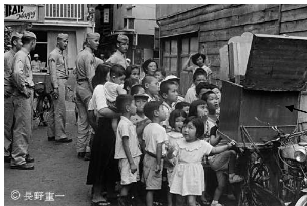
Mobile Picture Theater

1946. I was born in Nagoya City just after World War 2. And, I was raised in Nagoya. We were poor, but we did not think so. I think that those days were happier than now in a sense because everybody was poor after the war,